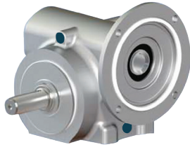
MPNS SOLID OUTPUT