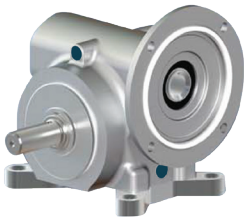
MDPS SOLID OUTPUT WITH BASE FEET