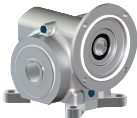
MPTS HOLLOW OUTPUT WITH BASE FEET