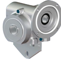
MPRS HOLLOW OUTPUT WITH TORQUE ARM BRACKET