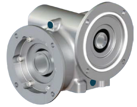
MSFS HOLLOW OUTPUT WITH OUTPUT FLANGE