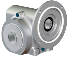
MPSS HOLLOW OUTPUT